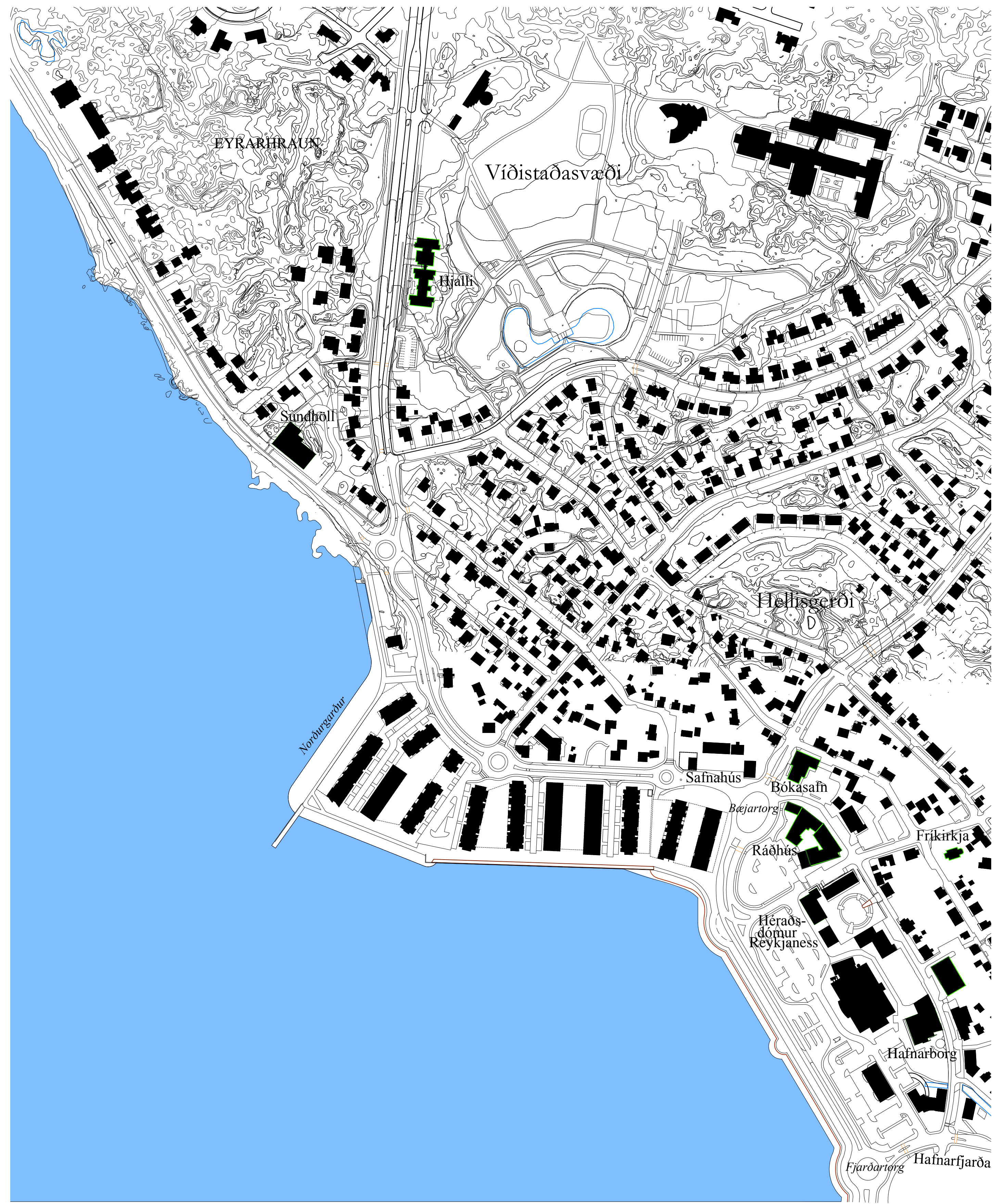
Byggðamynsturskort mkv 1:2500