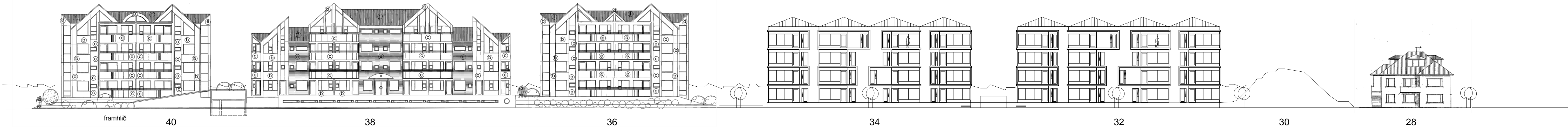
Götumynd Herjólfsgata mkv 1:300